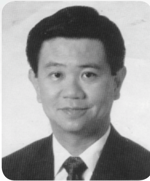
Mr Wong Kan Seng Minister For Home Affairs