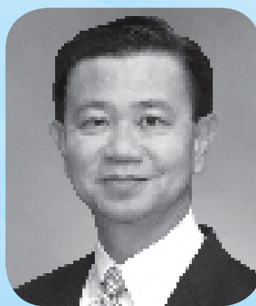
Mr Wong Kan Seng Deputy Prime Minister and Minister for Home Affairs