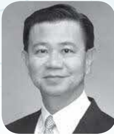
Mr Wong Kan Seng Deputy Prime Minister and Minister for Home Affairs